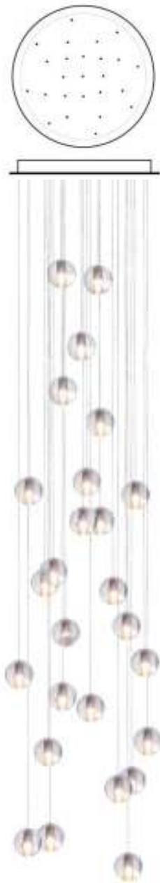
GLOBE LIGHTING - CBPL26