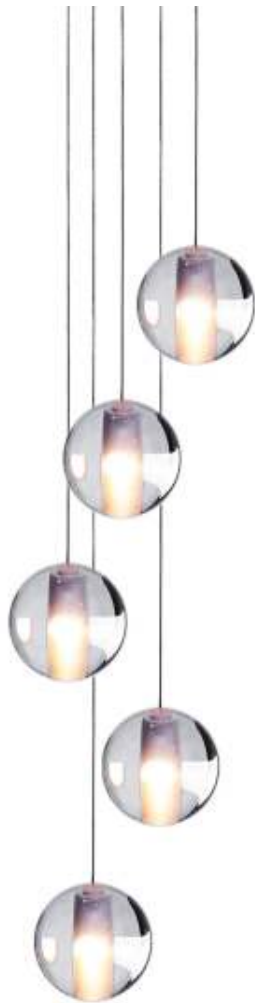
GLOBE LIGHTING - CBPL5